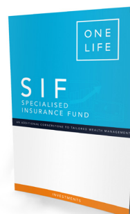
The specialised insurance fund